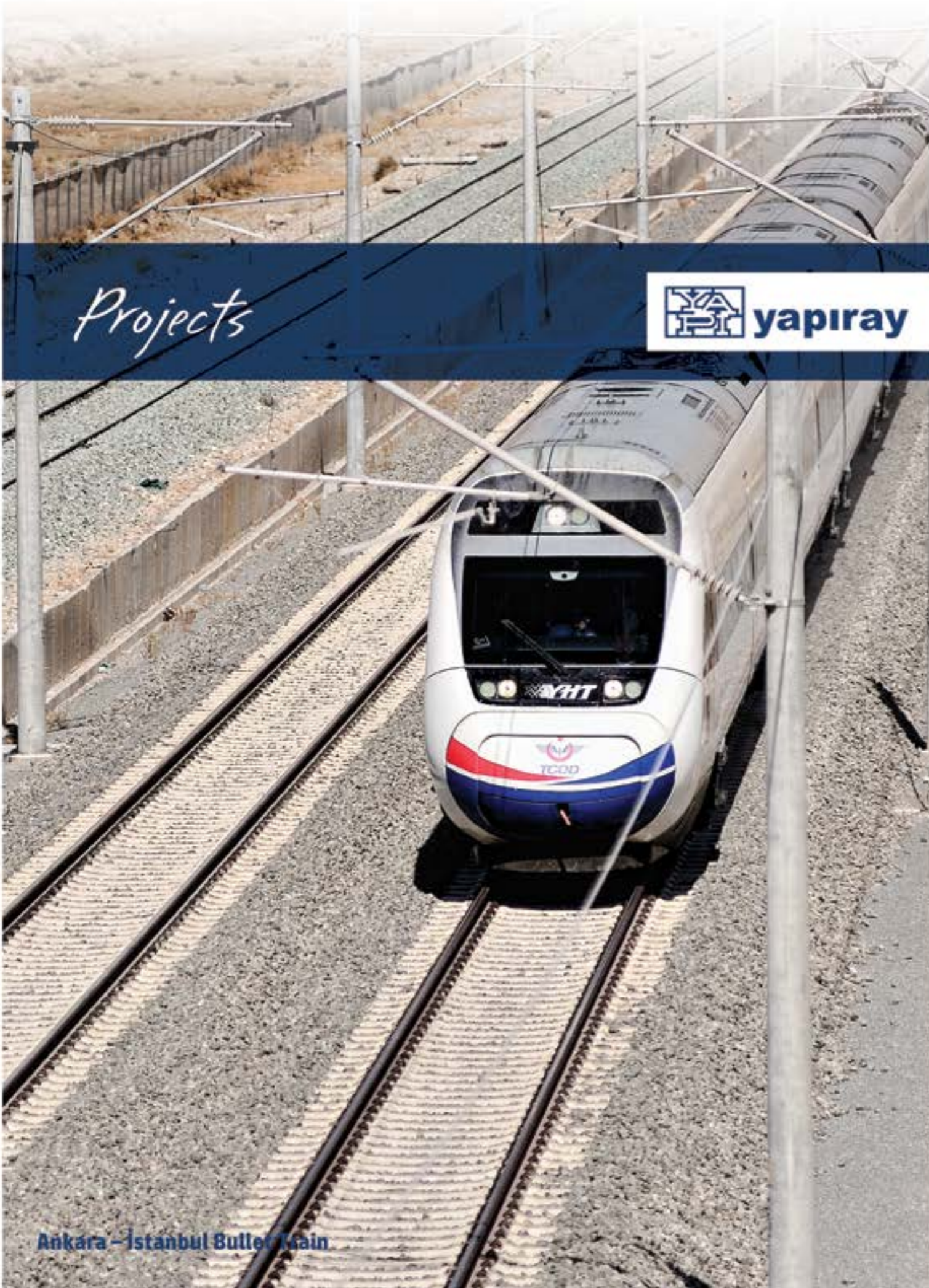
Ankara - Istanbul Bullet Train

Ankara - İstanbul Bullet Train Butt Welding and Panel Prefabrication Works Ankara, 2005 - 2009