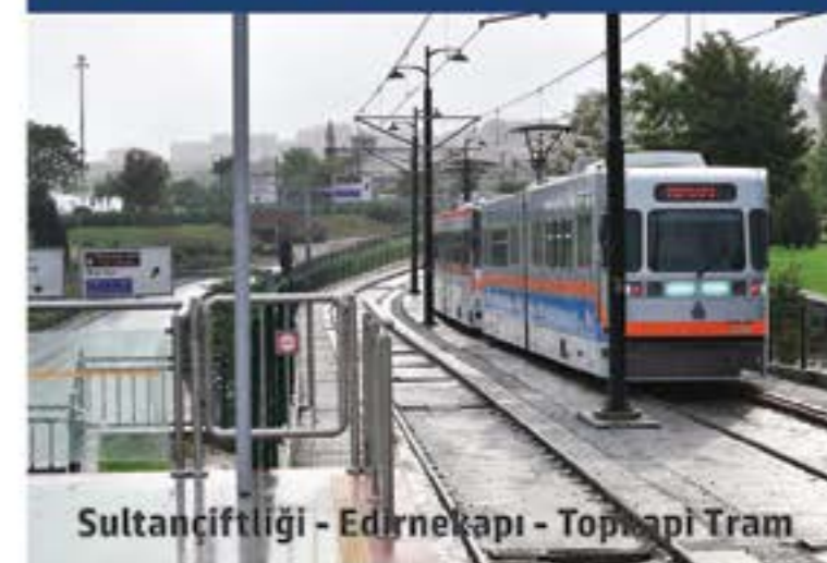
Sultançiftliği - Edirnekapı - Topkapı Tram