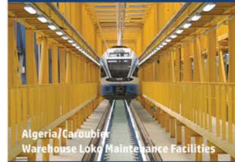
Algeria/Caroubier Warehouse Loko Maintenance Facilities